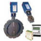
Electronic Flow Control